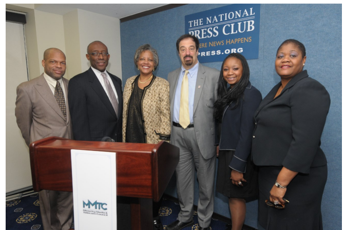
MMTC releasing "Digital Déjà vu" white paper at Feb. 2014 press conference

For a full list of MMTC's filings and papers, please visit: http://mmtconline.org/law-and-policy-documents/